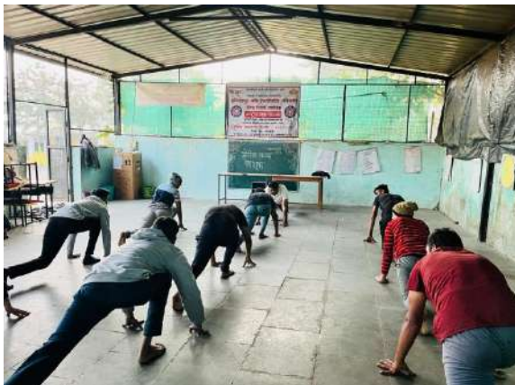
Morning Yogasan by Volunteers