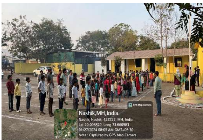
National Anthem with School Students.