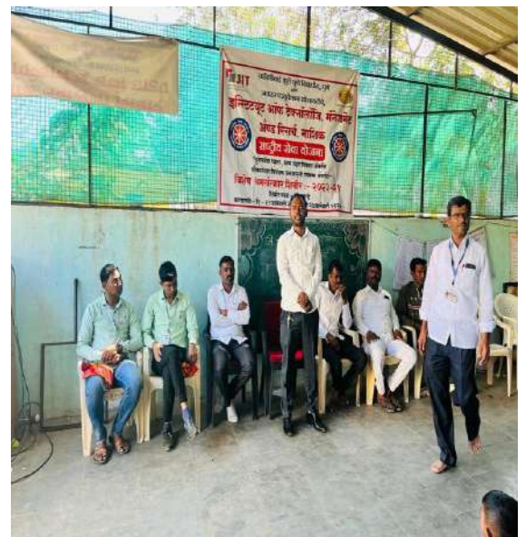
Speech by village Sarpanch