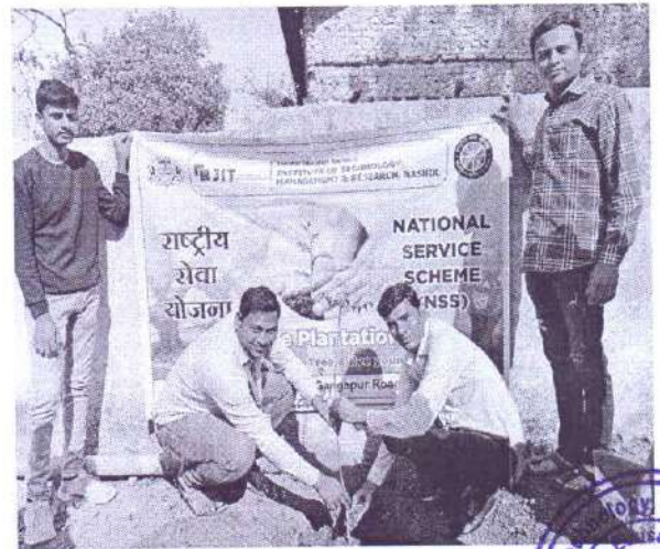
Tree Plantation by NSS Students volunteers.