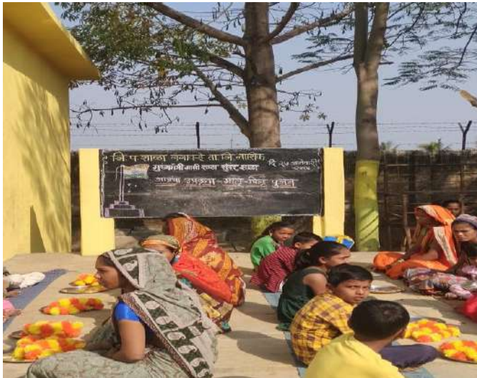
Matru-pitru Pujan program in village school