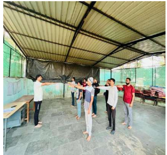
Students Sung the Rashtriya Seva Yojana song.