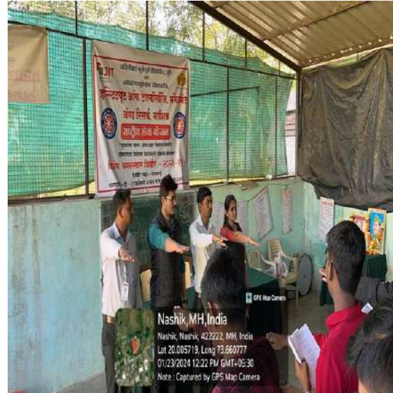
Volunteers taking oth.