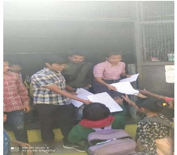
Stationary Distribution to school students by volunteers.