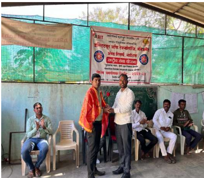
Felicitation of program officer by village Sarpanch