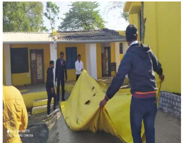
NSS volunteers doing help for Republic day celebration.