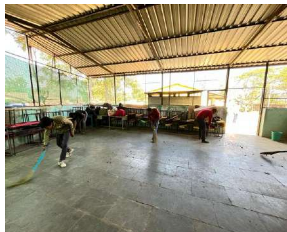
Cleaning Staying Location for Volunteers