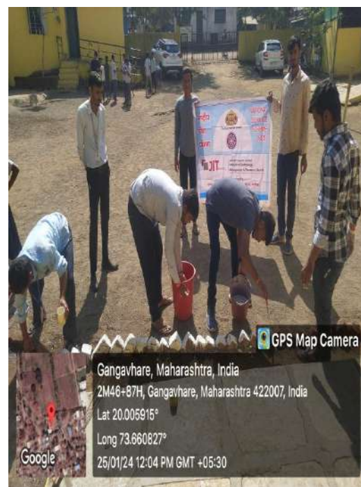
Zilla Parishad school premises were painted on occasion of 26 January.