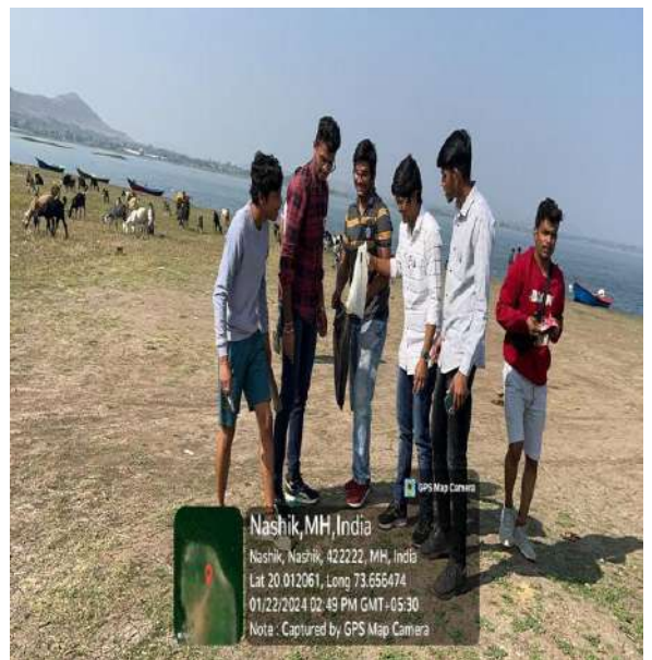
Student Volunteers Collect plastic bags and Bottle from Gangapur water dam area.