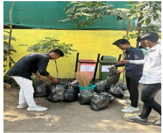
Plastic collection from Village