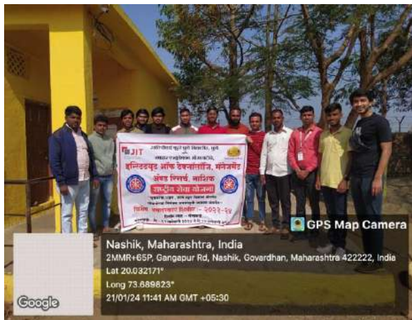
First Day Photo With Village Sarpanch.