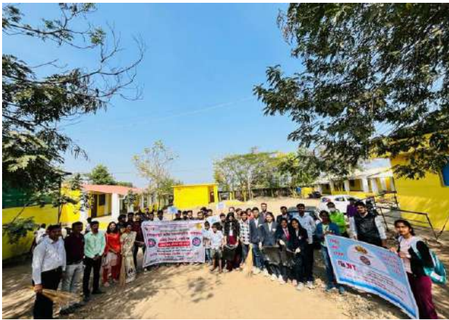
Gram Swachhata Abhiyan