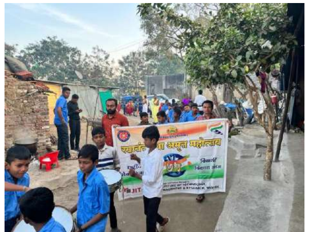
Republic day celebration