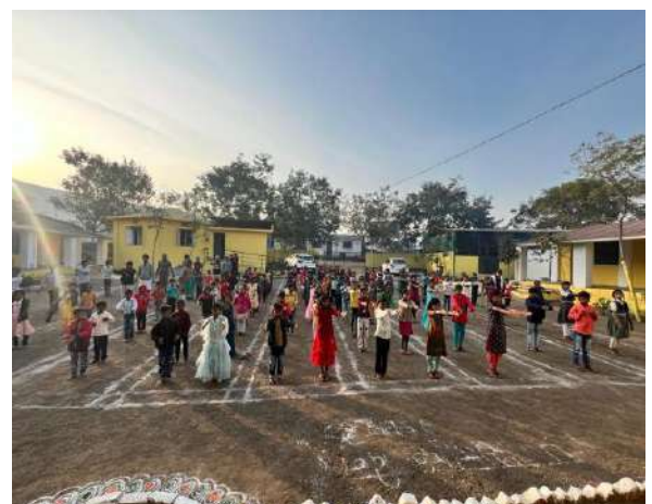
Exersize with school students.