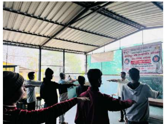
Rashtriy Seva Yogana Song