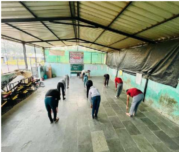
Volunteers wake up in the morning and do yoga exercise.