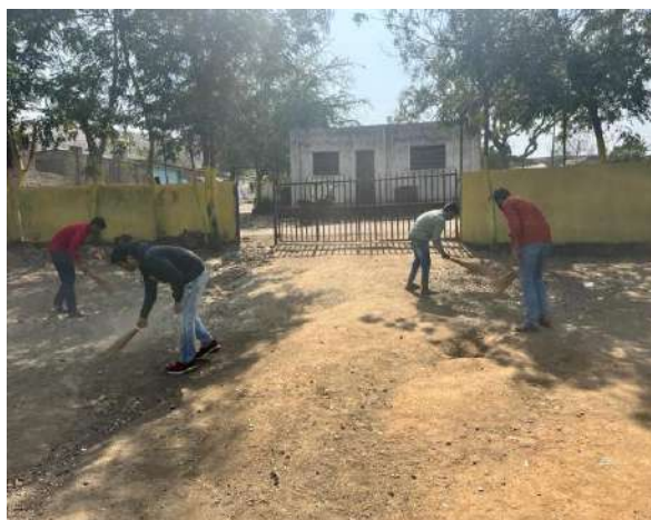
Cleaning Z.P.School Premises