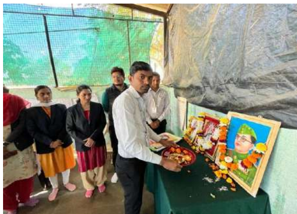
Netaji Subhash Chandra bose Jayanti celebration