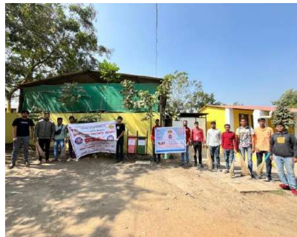
Cleaning Z.P.School Premises