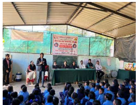
Speech on Netaji Subhash Chandra bose