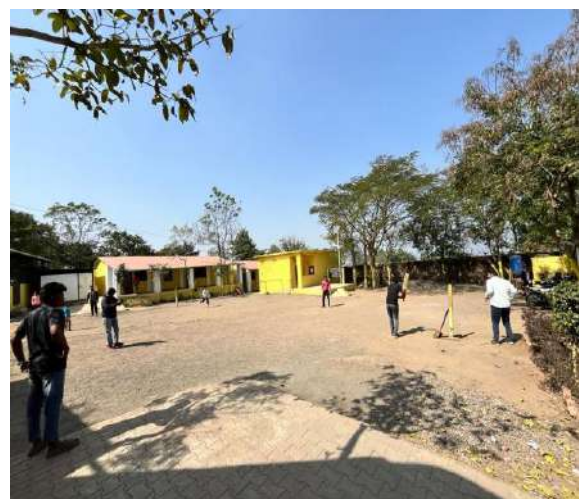
Student Volunteers Playing Cricket