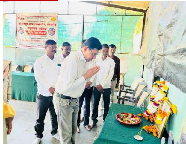
Lord Shriram And Mata Saraswati Pujan