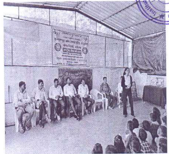
Student volunteers told their experiences in the camp.