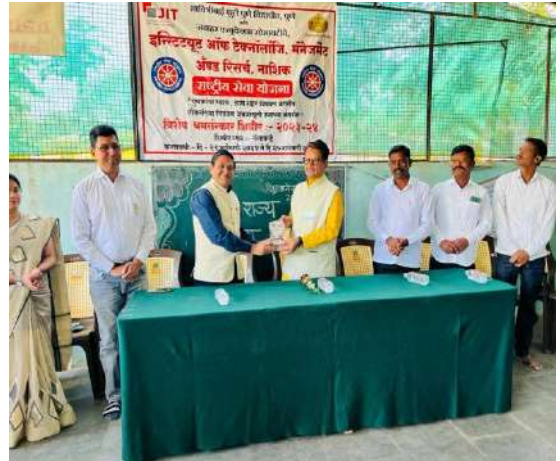
Felicitation of Chief Guest